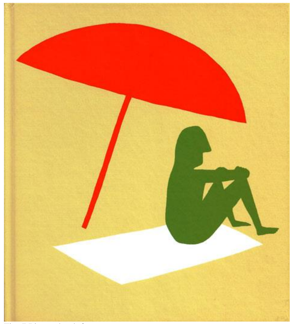
Fig. 7 Picture book front cover

Publicação original: RAMOS, A. M. & RAMOS, R. (2011). «Ecoliteracy Through Imagery: A Close Reading of Two Wordless Picture Books». Children's Literature in Education : 42:4, pp. 325-339 (DOI 10.1007/s10583-011-9142-3)