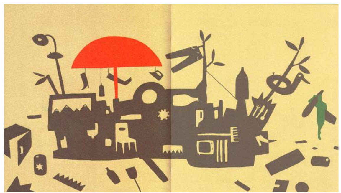
Fig. 10 Tenth opening