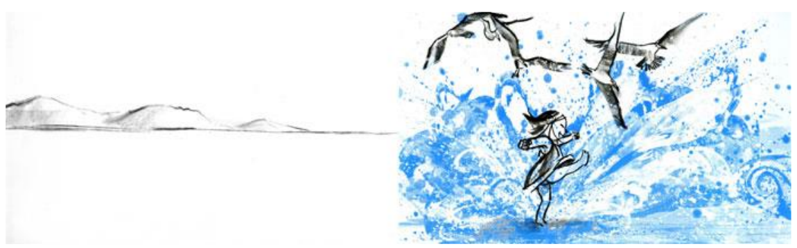
Fig. 5 Eighth opening