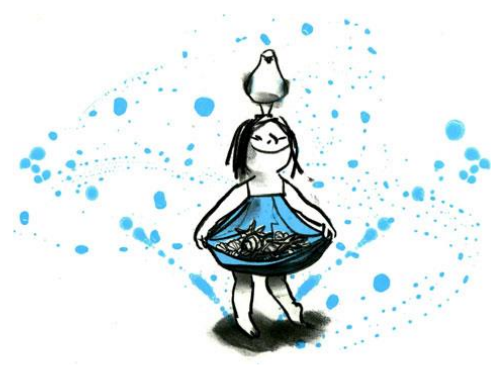
Fig. 3 Detail from the back cover

The actual medium used is also pertinent, and here, the decision to draw in charcoal has opened up the possibility of producing lines of different widths and shades, suggesting not only a sense of childlike rawness and simplicity but also of dynamic motion, achieved through rapid and uninhibited sketching. Aside from this, charcoal is a very effective medium for conveying character through facial expression, posture and even mood. With minimum resources it maximises interpretive possibilities.