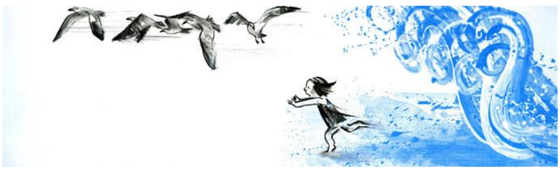
Fig. 6 Tenth opening

elements but also to indicate a fusion of these very elements. Each one of the eleven double-page spreads preceding the "plunge" and "bath" expresses a different emotion experienced by the child as she moves towards the sea in a game of discovery, which functions as a metaphor for the process of emotional, interpersonal bonding. From an initial curiosity to a more detached attitude of challenge, soon to be punished by the intervention of the sea, the pictures portray, in a sequential manner, fear, a longing for domination, mesmerised gazing, attempts at closeness, control, contentment and excitement (Fig. 5), surprise, fright and fear (Fig. 6). These spreads all provide evidence of the child's growing self-confidence and of her ongoing progress towards self-discovery.