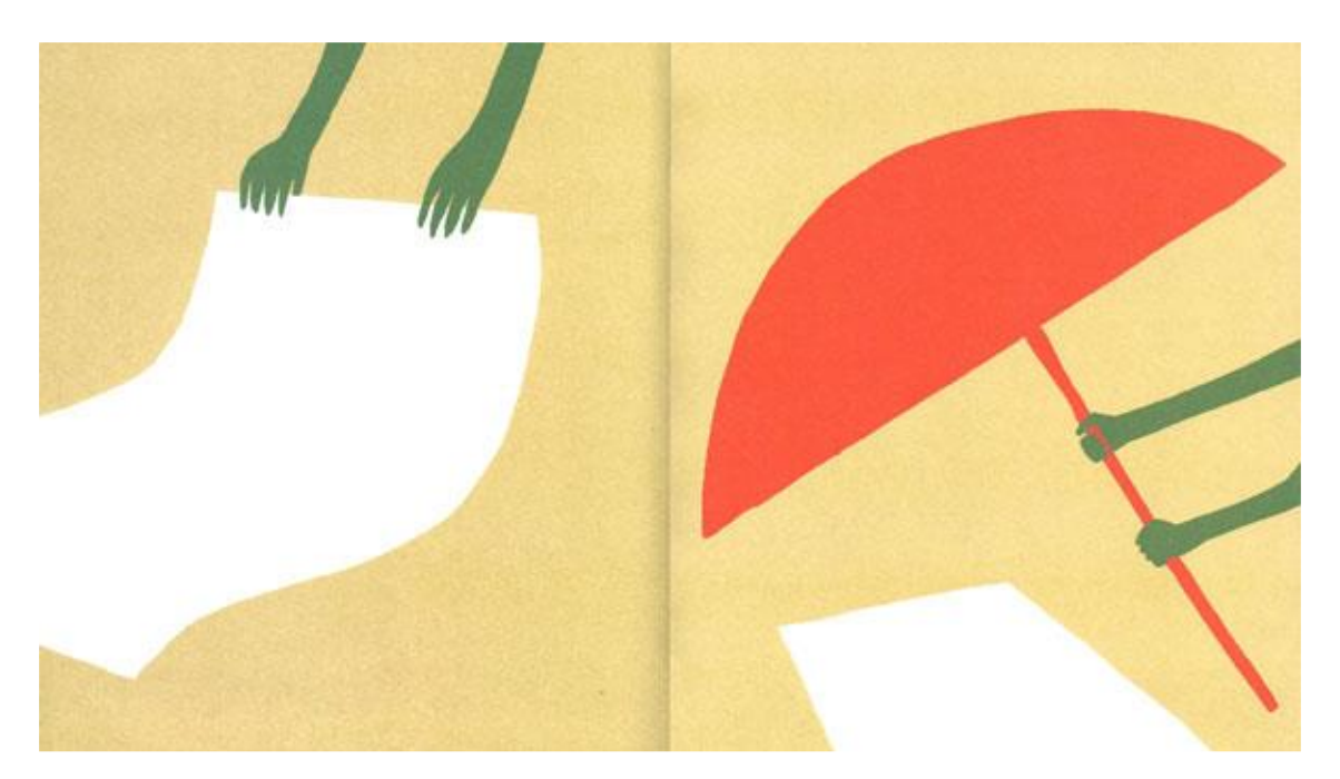
Fig. 9 Second opening

Once the initial situation has been outlined across four pictures, a conflict emerges in the shape of an unknown object spotted in the sea. The scrutinising attitude of the man, highlighted by the position of his hand, is turned into action in the next picture as the protagonist heads towards the sea in order to retrieve the object. In the space of time separating this picture from the preceding one, some intermediate actions will have to be inferred by the reader; namely, that the man has stood up, headed towards the water and entered the sea. The production of meaning