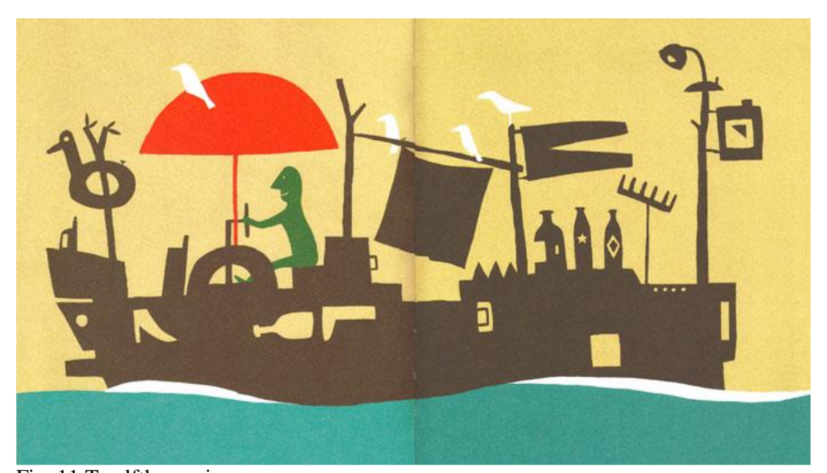
Fig. 11 Twelfth opening

When faced with bizarre and unexpected circumstances, he succeeds in altering and transforming them to his advantage, certainly, but also for the benefit of everyone else in the ecosystem. The increasingly distant perspective, in line with a progressive zoom out which extends to the final endpaper, gives readers both an indication of closure and, simultaneously, of openness, since the man's journey seems to extend beyond the limits of the book we are in the process of reading. It should be noted that the suggestion of movement implicit in seafaring is conveyed by a change in focus, which allows the blue colour to spread out progressively until we reach the final endpaper. This one differs from the opening endpaper in some small but rather significant details; namely, with the