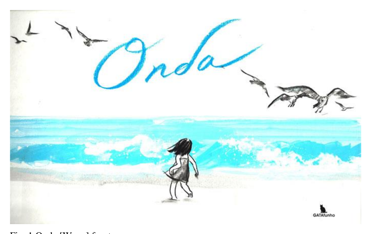
Fig. 1 Onda [Wave] front cover

With its contrasting halves (see Fig. 2 below), the double-page spread is effectively used to evoke a dialogue between three natural elements (i.e. air, earth and water) and a child protagonist who finds herself at the beach for the first time, exploring this new environment, and appearing to defy the strength of the sea, but only to end up being surprised by it. The technique relies on a chromatic interplay, including the use of black and charcoal grey, to figure earthly elements, while blue is used solely for the sea. The seagulls that witness this silent dialogue and its effects suggest movement and dynamism, which are striking features in a publication that eschews words in the act of telling a story. To a large extent, the seagulls replicate, as if in an echoing or glossing effect, the child's gestures and emotions, imparting remarkable dynamism to the scenes, filling out voids, drawing readers' attention to other sections of the page and allowing readers to share with the girl the role of leading character. In addition, the seagulls highlight the fusion of the conflicting