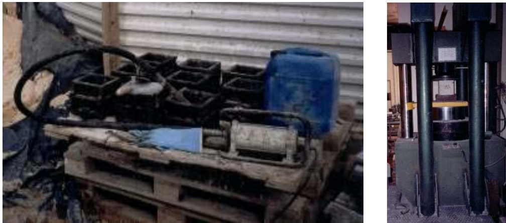
Figure 1: Vibrator, moulds and equipment for compression test

accomplishment of the tests existent equipments were used at the Laboratory (Figure 1). We compared that results with three core results token from that sites (Figure 2).