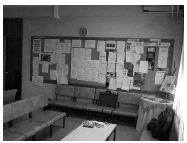
Figure 1 – Photograph of the teacher's common room and the available display

issues and consider the overall impact of the artifact (who contributes, who is willing to contribute, how authorisations are carried out, who will benefit and who sees an increase of his/her work).