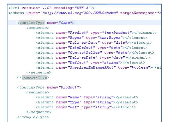
Figure 4 – Excerpts and tables from XML Schemas for some case information.