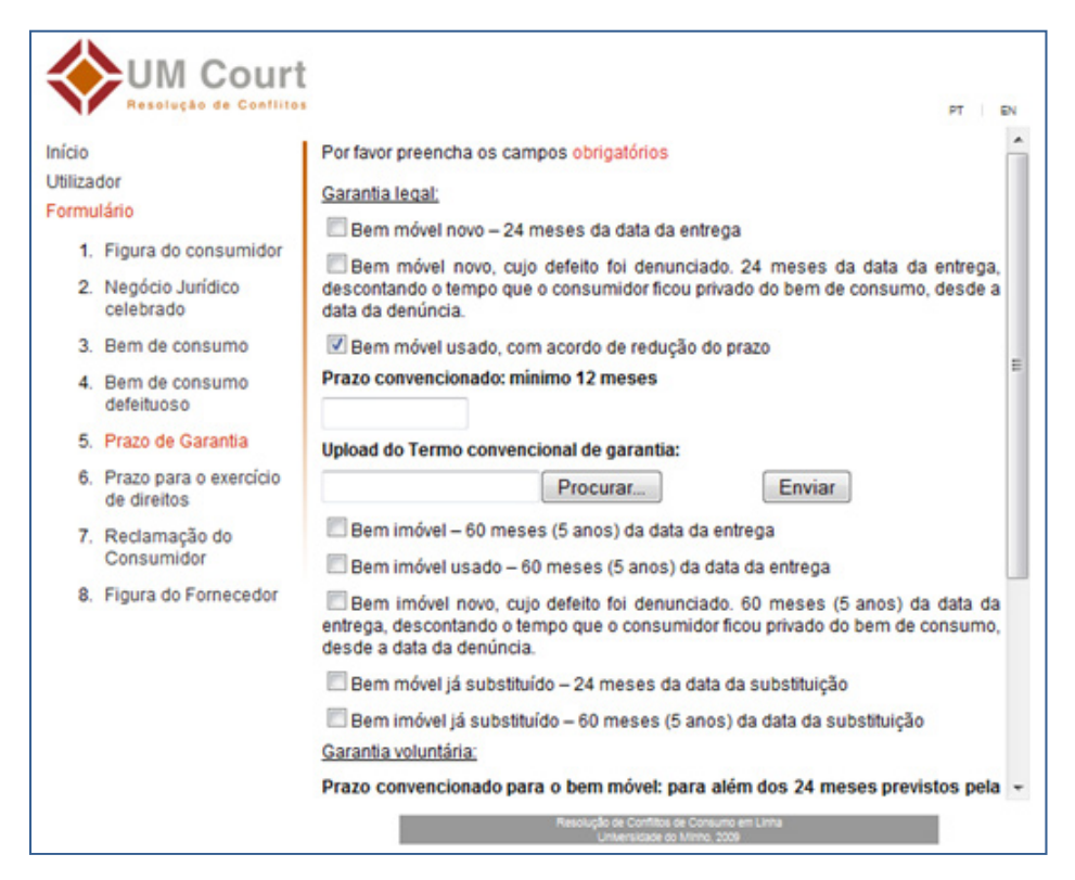
Figure 3 - Online form.

two big colored rectangles and the result of its intersection, the ZOPA – Zone of Potential Agreement (Lewicki, 1999), another very important concept that allows the parties to see between which limits is an agreement possible. The picture also shows each case and its position in the ordered axis of increasing satisfaction, in the shape of the smaller rectangles.