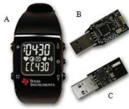
Fig. 1. Commercial eZ430-Chronos watch [2], A) e430-Chronos, B) eZ430 USB emulator, C) USB-RF Access Point