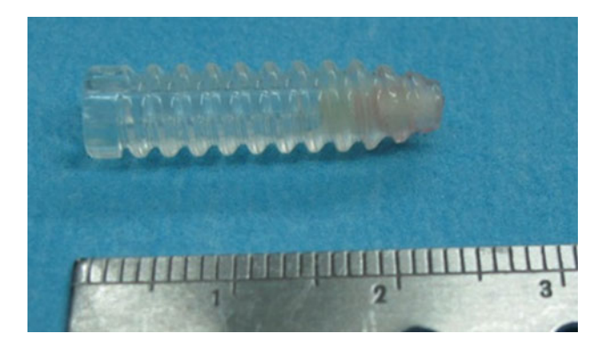
Fig. 2 Clinical case 2: 28-year-old male. Patellar tendon graft ACL reconstruction 12 months before. Pain, effusion and joint blocking subsided. PLLA screw from Arthrex (Naples, FL, USA) removed after 1 year of implantation in the human body

to understand several other findings such as cyst formation [25, 29, 32]. These problems are mostly reported in studies involving implantation of PLLA-based screws. This observation can probably be explained by the fact that, up to now, this polymer is the most frequently used in ACL surgery [10, 21, 46]. From our analysis, it seems to be more frequent in the tibia [7, 19, 25, 29, 42, 44, 55] and during application of hamstring grafts [7, 42, 44, 55], but the low