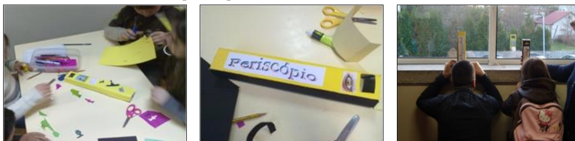
Figure 3. Periscopes built by the students.