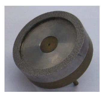
Fig.2 - Metallic (ring type) upper body used in previous FRICTORQ fabric tests

An important factor considered in the FRICTORQ development was the contact (upper) body (see figure 2), that slides over the fabric sample; it pushes the torque sensor probe to measure the torque generated by the sliding friction occurring by the contact of the two bodies, the fabric sample and the contact body.