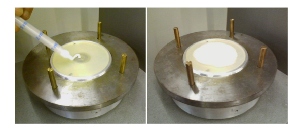
Fig.6 - Deposition of 0.5 ml of moisturizing cream

exfoliating cream. In order to standardize the tests, an amount of 0.5 ml of cream was applied and spread manually on the test face of the silicone rubber surface, which has an area of approx. 4.3 \text{ cm}^2 , corresponding to 0.12 ml of cream per cm<sup>2</sup> (see figure 6 for the testing setup and cream deposition).