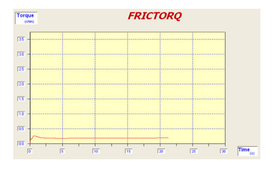
Fig.8 - Graphical output representing the torque measured versus time for the moisturizer cream

In preliminary tests, multiple measurements were carried out in a dry situation, without any cream present in the contact zone, and then with each one of the creams mentioned in the beginning of this section. In these tests, the cream was spread using a spatula with an amount sufficient to cover the entire silicone rubber surface, corresponding to the amount used on an equivalent area of skin. A typical graphical output obtained in these tests can be found in figure 8.