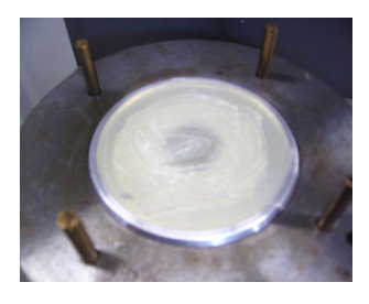
Fig.7 - Cream film applied manually to the lower support base of the silicone rubber

During the preliminary tests it was found that the amount of cream to be applied was exaggerated, and very high values for the friction coefficient were obtained due to the accumulation of cream at the front of the three contact surfaces of the upper body. It was then decided to apply on the silicone rubber the same amount of cream that would be applied on the same area of the human skin (see figure 7).