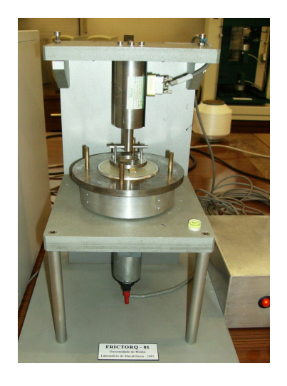
Fig.1 - The FRICTORQ instrument

references will be made to the experimental procedure used to test cosmetic creams and to the analysis and discussion of the preliminary results obtained so far.