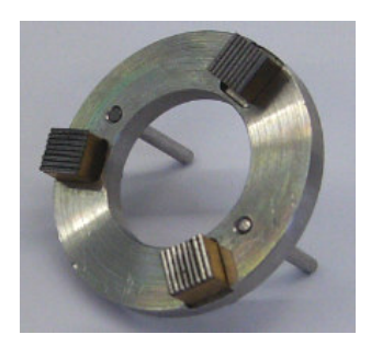
Fig.3 - Upper body with three contact surfaces

Other upper contact bodies were produced to enable different testing conditions (with different surfaces and contact pressures). Another type of contact body used presents just three contact surfaces placed at 120° (see figure 3), in which a new fabric portion is always tested by the contact established by the three surfaces.