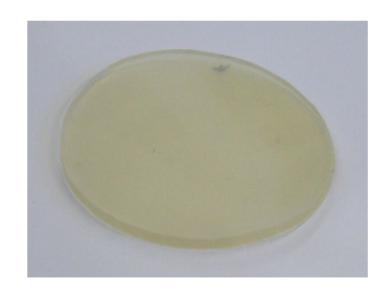
Fig.4 - Support test base surface in silicone rubber

The sponged support base surface, where the fabric samples were placed in the previous FRICTORQ method, was replaced by a silicone rubber, since it was the material that better simulates the human skin [2, 3]. Since the FRICTORQ is a rotary tribometer, the test support base (as presented in figure 4) is a disc shape with a thickness of 3 mm.