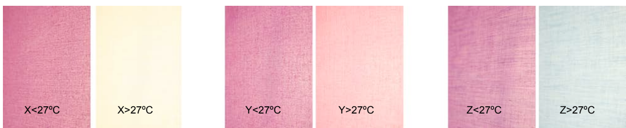
Figure 4: Photos of transmittance light for X, Y and Z samples

The photographic record, figure 4, of the X, Y and Z samples transmittance, provides a visual confirmation of similarities when the three samples are below the TC pigments temperature variation. When they are above the trigger temperature, the TC pigment fades away and the transmittance is detected through the lack of colour on sample X, the conventional pigment magenta on sample Y and blue on sample Z.