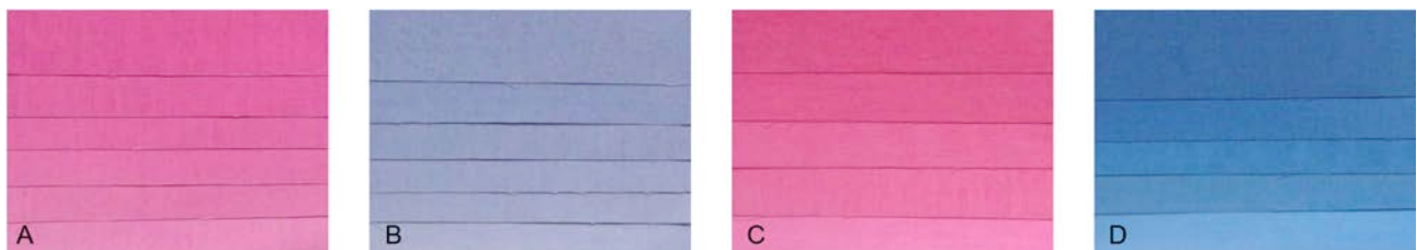
Figure 1: Samples with different concentrations of TC (A and B) and conventional pigments (C and D), increasing concentration from the bottom upwards.

The printing pastes were applied on a Zimmer Mini MDF R541 screen printing table. On each sample, an open screen was placed above the fabric and each solution was applied in one layer. After drying, each sample was thermo fixed in an oven at 150°C during 3 min.