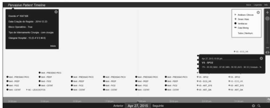
Fig. 1. Example of the Pervasive Patient Timeline

In Figure 1, is an overview of the Pervasive Patient Timeline. In this figure is data concerning a patient admitted into an ICU. Specifically, there is information retrieved from the hospital's VS, VM, LAB, DS, EHR and ENR data sources. In this figure is possible to consult critical events (as red), patient admission information and choosing the data sources. As example of event description of an event is possible consult maximum, minimum and average values of the hour, along with the respective unit.