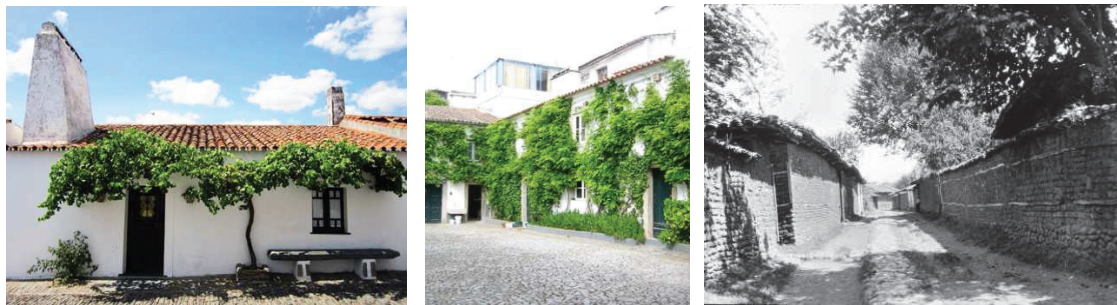
Figure 6. Use of vegetation for shading. (left, center) Portugal; (right) Albania.