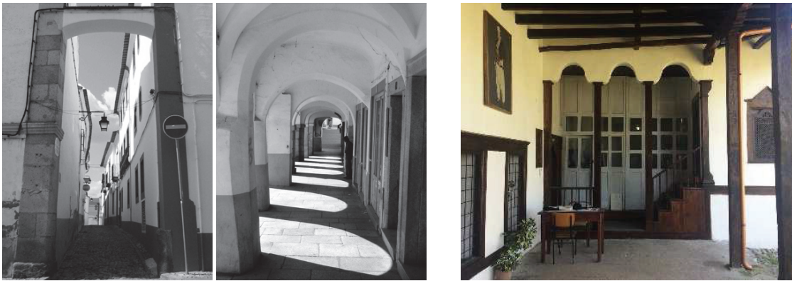
Figure 3. (left) Narrow street,(center) covered gallery (urban), Portugal; (right) covered gallery (building of MuzeuEtnografik, Kavaje), Albania.