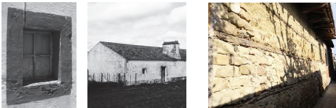
Figure 7. Small openings. (left; center) Portugal; (right) Albania.

The type of colour that is used on façades has influence on indoor temperature (Givoni, 1994). The traditional whitewashed surfaces (facades, terraces and floors) (Fig. 8) are an important element to mitigate solar radiation, allowing a reflectance of about 90% of all the radiation received (Koch-Nielsen, 2002).