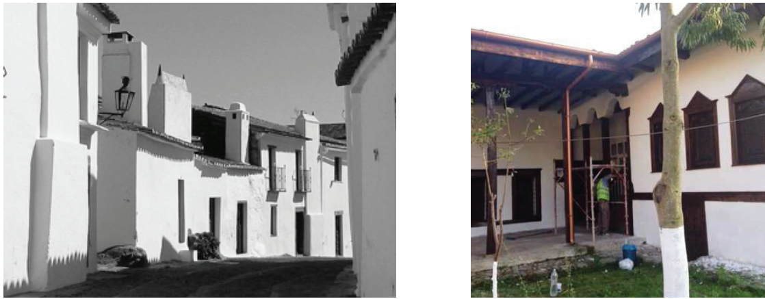
Figure 8. Use of light colours. (left) Portugal; (right) Albania).

Regarding materials, the main building materials in the regions under analysis are rammed earth and adobe blocks. The greatest number of adobe constructions in Albania belong to the Ottoman period. Its implementation is present especially in the center part of Albania, both in urban and rural dwellings. These buildings are scattered in Tirana, Elbasan, Kavaja, Peqin, Lushnje, etc. A small presence can be found also in Kucove, Peshkopi. In Portugal, the southern part of the country is dominated by the presence of rammed-earth buildings.