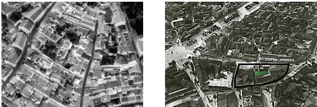
Figure 2. Compact urban layout. (left) Évora, Portugal; (right) Tirana, Albania.

Regarding sun exposure and orientation, buildings seek the south quadrant to maximize solar gains in winter and to reduce them during summer. The façades facing the south-quadrant facing façades are the most common to receive less radiation during summer and more in winter. At the same time, east and west facing façades have less area exposed to minimise direct heat gains, and the rear façade (without or only with a few openings) is oriented to the prevailing winds.