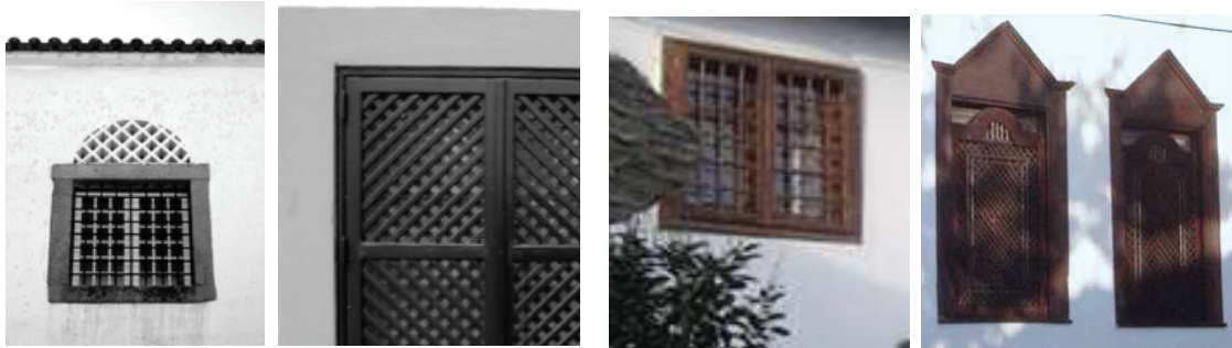
Figure 5. Shutters and ventilation grids. (left) Portugal; (right) Albania.

The use of vegetation as shading as multiple applications, not only shading the ground but also applied as pergolas and as a shading screens for façades (Fig. 6).