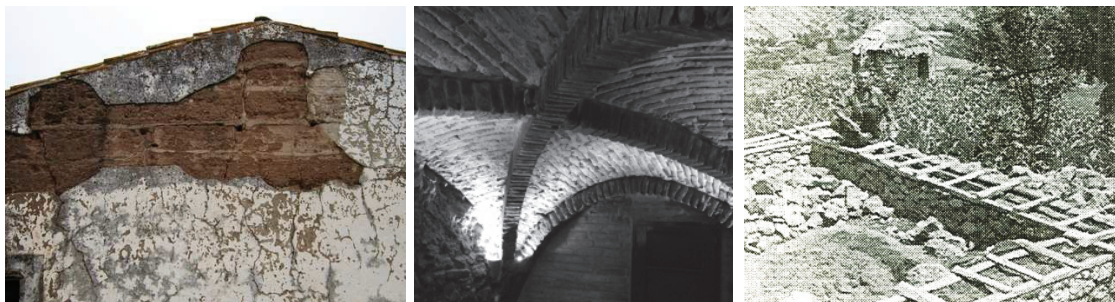
Figure 9. Heavy mass materials. (left) rammed-earth wall, Portugal; (center) Vaulted ceiling, Portugal; (right) stone foundation for adobe wall, Albania (image source (Muka, 2007)).