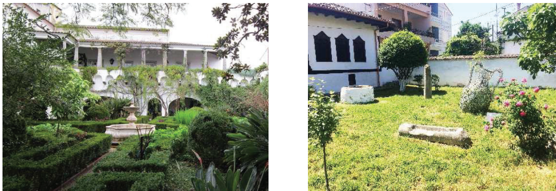
Figure 4. Patios containing vegetation and water elements. (left) Portugal; (right) Albania.

In what the patios concerned, these are a passive cooling strategy that is intrinsically related to the presence of Roman and Arab cultures in both countries. This feature allows minimising sun-exposed surfaces, maximising shade and ventilation and also natural light and ventilation for indoor spaces. The presence of vegetation and water elements is frequent (Fig. 4). Their presence has a positive influence on the microclimate around buildings. An experiment conducted in southern Portugal during summer showed that air temperature in the patio always remained lower than those recorded for the city centre, with a maximum difference of around 9°C during daytime (Fernandes, Mateus, et al. , 2015). This is due to the effect of evapotranspiration and shade from plants and evaporative cooling of water. The use of vegetation is useful to provide shade and to increase air moisture via evapotranspiration process, helping to cool the air streams before entering the building. Since a green ground absorbs only 10% of radiation, it also allows reducing the heat island effect (Koch-Nielsen, 2002). The presence of water elements, as fountains or wells, serve to cool the air by evaporation (evaporative cooling).