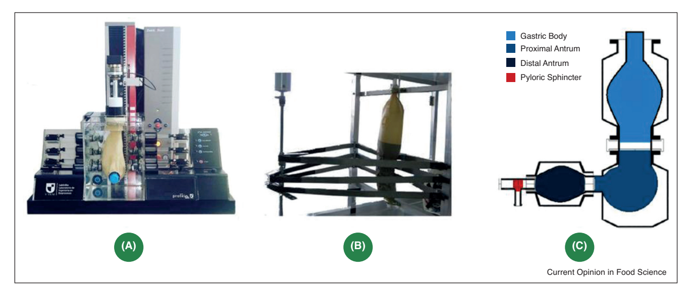
In vitro gastric models containing different mechanisms to simulate the human gastric peristaltic movements where (a) represents the IMGS, (b) represents the in vitro gastric device and (c) represents the TIMagc (reprinted from References [40°,42,41], respectively, Copyright 2017, with permission from Elsevier (a and c) and Dissolution Technologies, Inc. (b)).

coupled with a peristaltic mechanical system consisting in a three belt apparatus (Figure 2b). The authors used latex to achieve the appropriate deformation characteristics of the human stomach, with an oval shape. The belts were strategically positioned at the top, middle and bottom of the stomach model, reproducing three contractions per minute [42]. Also, an 'advanced gastric compartment' (TIMage — Figure 2c) has been developed to study food gastric digestion. The authors built three compartments simulating the gastric body, proximal and distal antrum and the model was coupled with a valve to mimic the pyloric sphincter. The stomach peristalsis was simulated by synchronously contracting inner membranes on each compartment, simulating the human stomach motility [41].