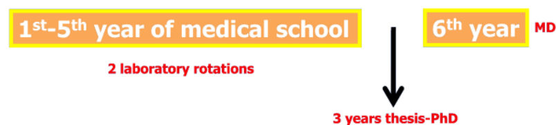
Figura 3. Schematic representation of the framework of the MD/PhD program at SM-UMinho.

It must, at this point, be said that a volunteer open culture of assessment, internal and from external institutions and panels, constitutes the pillar of progress in the SM-UMinho medical training. The feedback obtained represents a reappraisal of decisions taken and an opportunity for continuous improvement, which is considered seriously by the School. Publicly reporting should also be regarded as a duty, and therefore the pedagogical results of the SM-UMinho have been published in various congresses, by its faculty, non-faculty members and students. Despite its short 16 years history, the SM-UMinho has established numerous national and international partnerships. This sharing of results and experiences allowed the integration of SM-UMinho (or its members) in various national and international agencies, among which stands out the fact that the SM-UMinho is a founding member of the EBMA. The SM-UMinho is committed to contribute to the consolidation of the Medical Education community in Portugal.