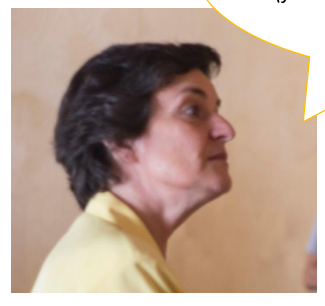
REMEMBER...? https://goo.gl/forms/NxLxIvAwLLTQ2xvE3 (just 5 minutes, please)

<u>paula.trigueiros@gmail.com</u> paula.trigueiros@arquitetura.uminho.pt