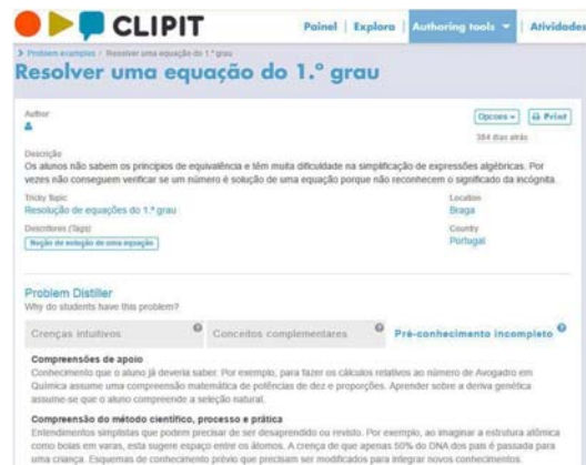
Figure 3: Problem Distiller to a 1st grade equation.

The Problem Distiller tool lists a set of problems that typically challenge students, helping the teacher to think and reflect on their experience working with students. Through this reflection, the teacher is able to identify the gaps in an understanding of the tricky topic and associate their own students' difficulties to the comprehension problems listed in the Problem Distiller tool. As they made selections from the Problem Distiller tool, teachers were identifying problems that students typically encounter in understanding tricky topics. At the same time, teachers were also able to reflect on why these problems occur and how they can be solved.