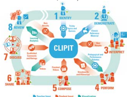
Figure 1: The JuxtaLearn Process.