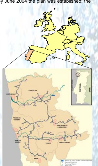
Figure 1 - Survey of the multi-municipal metropoli area of Oporto water supply system

The critical control point (CCPs) were identified, critical limits (CL) were established according to Águas do Cávado internal standards, operating procedures, and performance targets of the Quality Management System. Some of the CLs were taken on the safety side of legal standards parameters, in order to guarantee the overall water quality of the system. The compliance of CLs is verified through a wide range of parameters that are monitored with on-line sensors and on-site determinations. A sampling and laboratory analysis program at different points of the system has also been included. It is expected that the control measures and monitoring activities are effective enough to smoothly control the routine functioning of the system. However, if and when a CL violation is detected, corrective actions must be considered. Figure 2 shows the CCP's of whole water supply system, Figure 3 presents an example of CCP management, and Figure 4 depicts an example of turbidity behaviour.