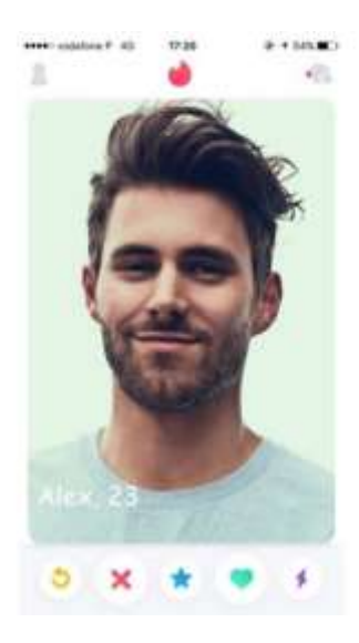
Figure 1. Example of a Tinder Profile

Each photo (see Stimull ) was used to construct a profile, and then all the profiles were used to simulate a Tinder application. Each profile had a picture with a name, attributed randomly and with the average age estimated by the independent female raters. Seventy-two trials were presented to each participant. There was no inter-stimulus interval, and after each response the next trial was followed. Also, there was no time limit to answer. In Figure 1, it is possible to see an example of a Tinder profile used.