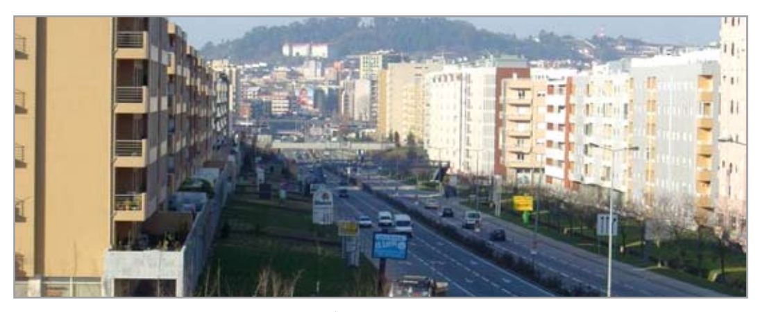
Figure 3: Flying across the city | Source: the author, Braga, Portugal, May 2006

Secondly, the "invasion" of urban or metropolitan areas on semi-rural areas, which already boast some urban characteristics, have been leading to a transformation of roads into streets with little infrastructures for pedestrians (Fig. 4). We can sense roads acquiring some characteristics of shopping 'streets', where people in cars can make "window shopping" – notably large furniture stores (many also small familiar furniture makers) and cars retailers, which require large amounts of display space. Thus we have roads or street-markets of great lengths along axes generally without a clear