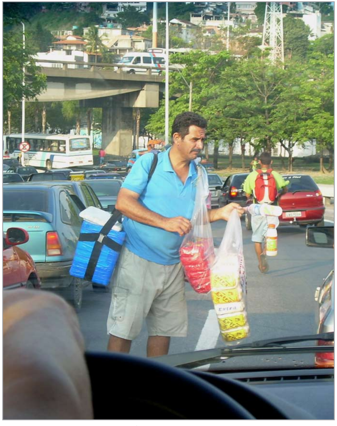
Figure 6: A daily working place | Source: the author, Rio de Janeiro, Brazil, October 2006