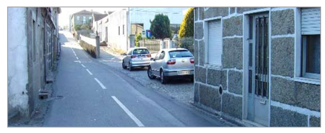
Figure 4: Are they streets or roads? | Source: the author, Covas, Guimarães, Portugal, October 2005

continuity<sup>10</sup>. In the northwest of Portugal these roads/streets have grown organically, lacking any spatial planning. They seldom comprise parking lots at the back of stores, and are mingled with industry, warehouses, residential houses and agricultural fields, originating circulation problems due to illegally parked cars. The commercial units along these streets generally lack elegance and quality, and therefore do not function as renovating generators. As mentioned, there is little continuity and sense of cohesion between the various businesses<sup>11</sup>.