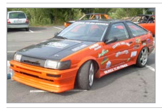
Tuning (the author, Guimarães, Portugal, 2007)