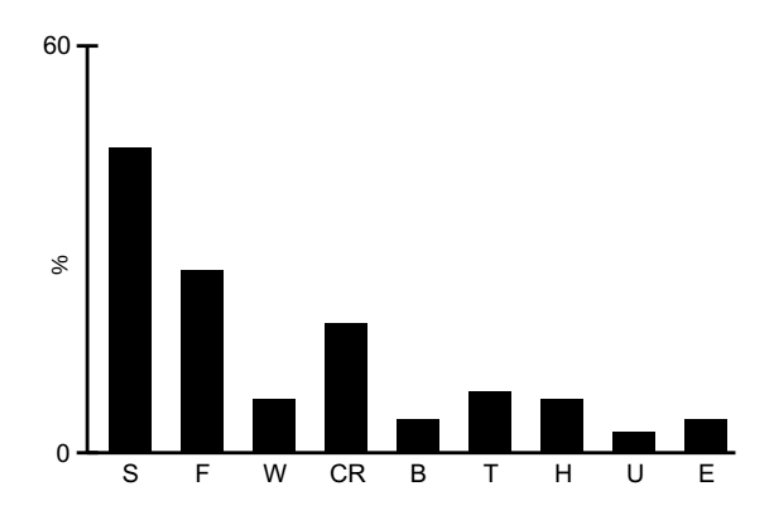
Figure 2. Ageing tests of which data were collected from the publications considered, S: salt weathering; F: freeze-thaw; W: wetting-drying; CR: chemical reactants; B: biological colonization; (see text for more information); T: thermal cycles; H: heating; U: exposure to ultraviolet radiation; E: exposure to weathering agents in the outdoors.

Figure 2 presents a plot that attempts to show the kind of agents that were used in the analyzed publications to promote the alteration of the rock specimens, again as a percentage of the dataset. The sum of the frequency values, again, gives a value above 100, since some publications consider more than one agent, such as salt weathering and freeze-thaw.