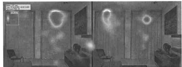
Figure 2. Heatmap from a PhD student research project.

A complete eye tracker system includes software that easily allow to produce visualizations of eye tracking data instantaneously. Usually, the most used visualizations are heatmaps (figure 2) and gaze plots that highlight where the person looked, the length of time and the gaze pattern their eyes followed. Using the words of Bojko [6]: “these visualizations are the eye candy of eye tracking”.