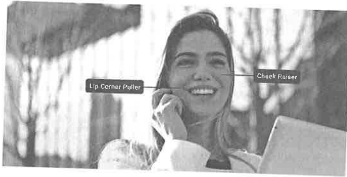
Figure 4. Happiness.

Each analysis software differs by metrics but in general they all include outputs related to seven basic emotions (joy, anger, disgust, surprise, fear, sadness, contempt); valence; arousal; appearance (age, gender, ethnicity), face tracking and head angle estimation.