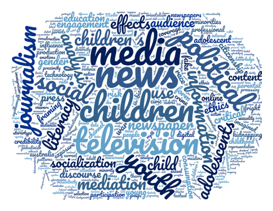
Figure 3: Map of keyword frequency

Figure 3 shows us that the keywords we used for research were adequate and that the cloud, in its whole, portrays some of the results achieved in this study. Apart from the attention paid to the words related to research (news and children and/or young people), a few other words, which identify the categories found through a review of the abstracts, were also highlighted: reception/effects (audience, effects); representation and production (analysis, content, discourse, framing); impact of parental mediation (mediation); impact of political participation or socialisation (political, social, socialisation); journalists' ethical concerns (ethics). Thanks to this tool the results may help the keywords identify the research done in this field.