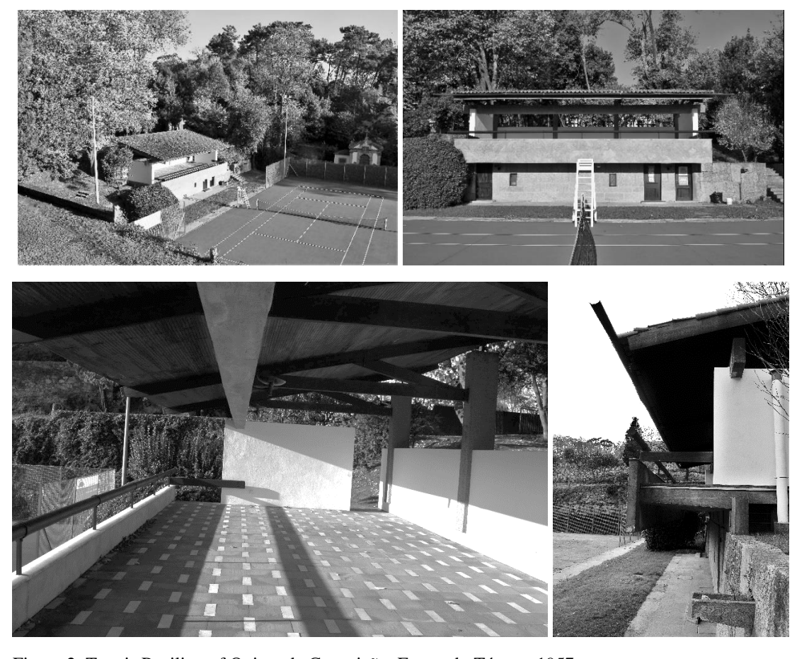
Figure 2. Tennis Pavilion of Quinta da Conceição. Fernando Távora, 1957. Photos of the current state by Eduardo Fernandes (2018).

On the upper floor, on both sides of the pavilion, we find two stone plastered walls (2 meters high and 3.4 meters long) based in the horizontal slab. These elements present themselves as the dominant elements of the lateral façades, shaping the space inside the shelter, but they do not enclose it completely. On the back side, there is a 1.1 meter passageway that allows access to the interior, while on the front side there is a 1.2 meter empty space above the abovementioned cantilever. In this empty space (on both sides of the pavilion) appears a wooden board (0.2 x 1.25 meters) protecting the users from falling. It is attached to the wall, on one side, and the other end fits between the handrail and the concrete protection of the main façade; in both directions, it extends beyond the necessary dimension for its function and fixation.