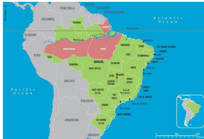
Fig. 1. States crossed by Tucuruí - Macapá - Manaus transmission line.

Figure 1 presents a map of Brazil highlighting the three states crossed by the transmission line and Figure 2 shows a scheme of the 3 lots considered. At an initial design stage different alternatives for the route and layout of the line were analyzed taking into account expected environmental impacts and effect on local population which allowed to select the preferential layout described in Figure 2 [10].