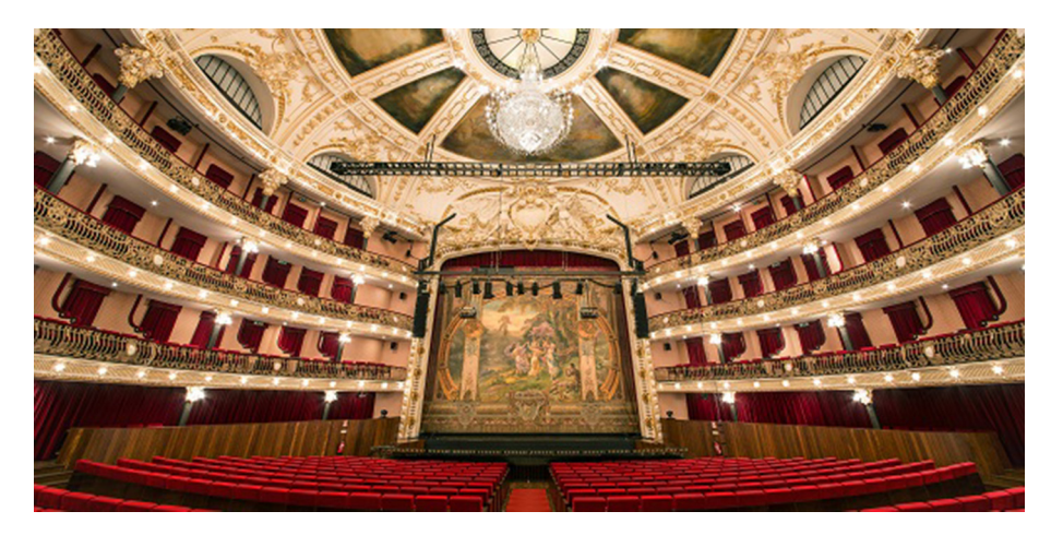
Fig. 1. Teatro Circo de Braga, EM, S.A.

Teatro Circo de Braga, EM, S.A., (see Fig. 1), is a company located in Braga, Portugal, that operates in the cultural sector, functioning in one of the most beautiful buildings of Portugal.