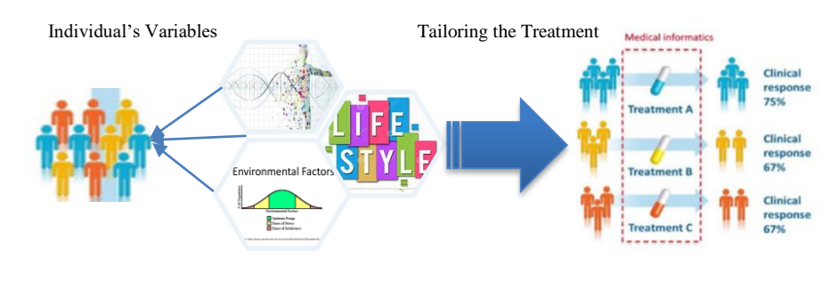
Fig 1. Precision Medicine

genetic, lifestyle, and environmental effects in medical decision-making. Additionally, distinguishing patients from other patients with the same symptoms, improving the performance of treatment, minimizing side effects and medical [10].