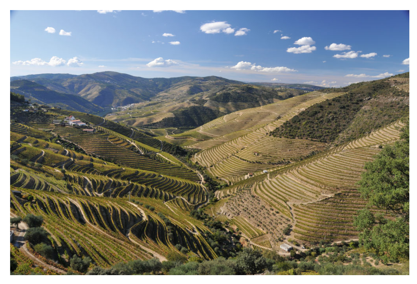
Fig. 11.9 Vineyards of the Cultural Landscape of Alto Douro Wine Region, a World Heritage site