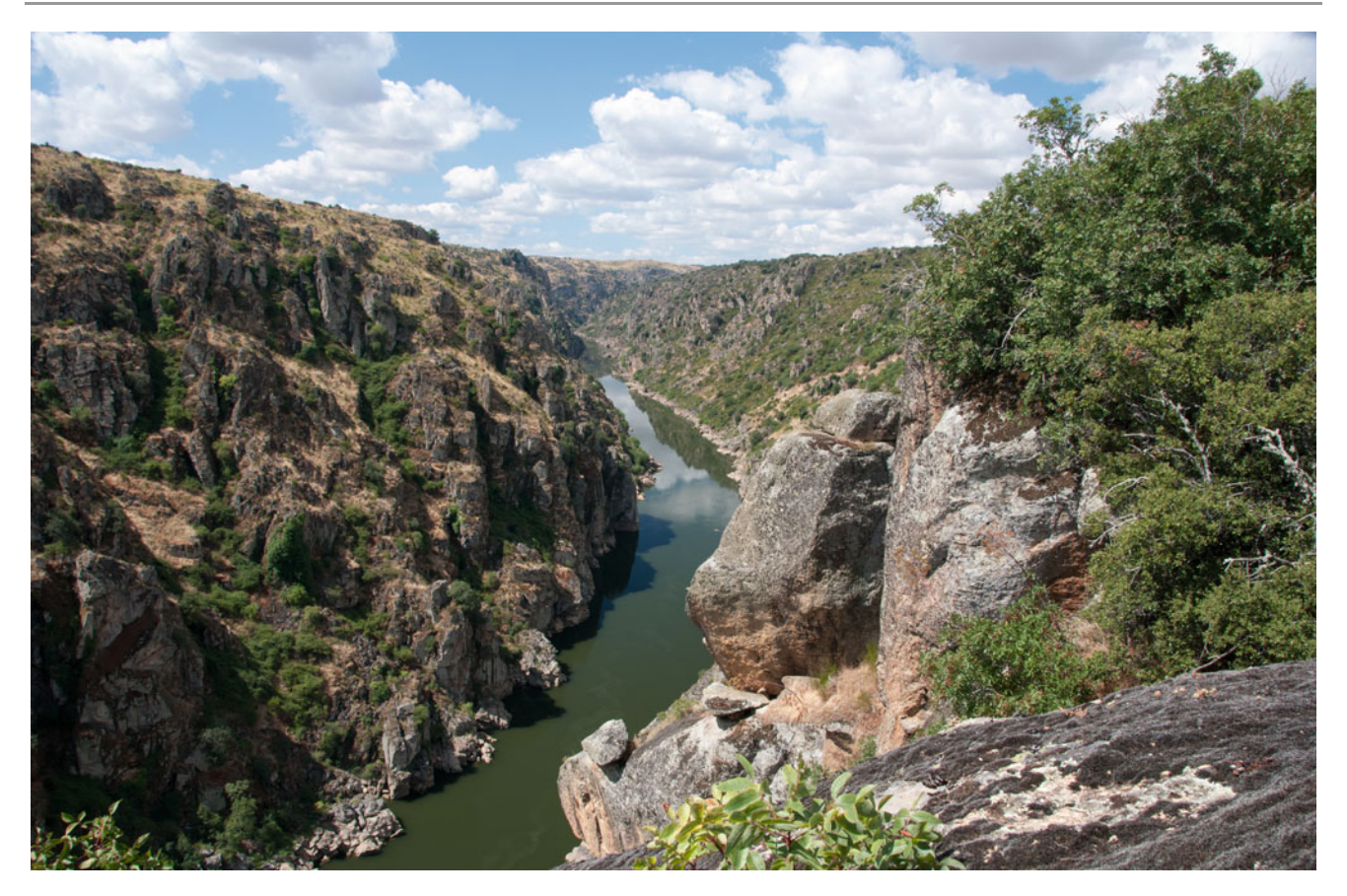
Fig. 11.8 Douro River canyon in São João das Arribas, Miranda do Douro