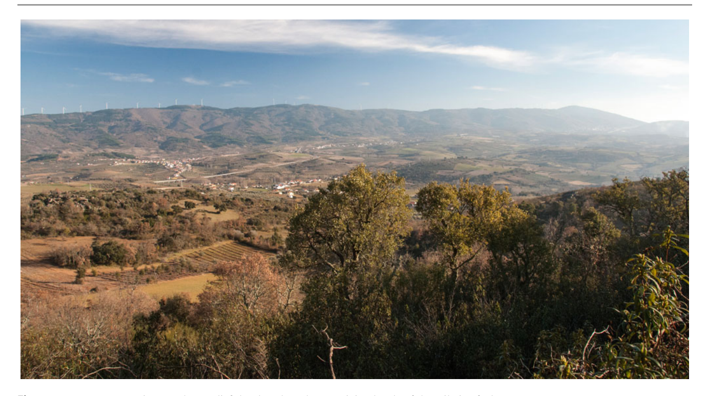
Fig. 11.6 Bornes Mountain, a push-up relief developed on the restraining bends of the Vilariça fault

being smaller, 6 km long and 600 m wide, the NNE-SSW basin has similarities with the Vilariça basin regarding landforms and deposits. It is bounded by steep granite slopes in the east and by a shale slope that expresses the western part of the Meseta surface in the west (Ferreira 1978). A clear NW-SE fault scarp also limits the Longroiva basin to the south (Cunha and Pereira 2000).