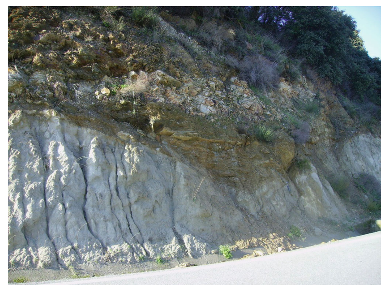
Fig. 11.7 Outcrop at the southern limit of the Longroiva basin documents the reverse movement of the Vilariça fault, with the Variscan bedrock (Cambrian) over the Vilariça Formation (Paleogene)

Cenozoic Basin, located in the east (Galve et al. 2020). The transition from the former internal drainage (endorheic stage) to Atlantic Douro drainage (exorheic stage) is best explained by a combination of two drivers: i. increasing intraplate compression, that progressively tilted the Douro Cenozoic Basin towards the west and ii. a major climate change by \sim 3.7 Ma (transition to a wetter climate stage), from the generally dry and hot climate during the Miocene and Zanclean to the humid and hot climate of the late Zanclean to Piacenzian. A latest stage (last \sim 2 Ma), marked by enhanced fluvial incision, is related to continuous regional low crustal uplift, cooler climatic minima and associated lowering of sea level (Cunha et al. 2019).