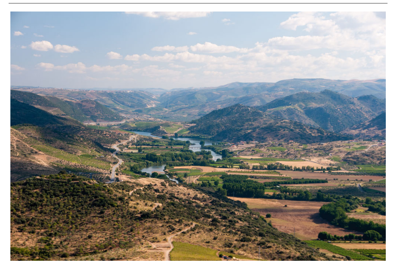
Fig. 11.4 Panoramic view of the Vilariça basin to the south, where the Vilariça fault controls the Douro River course