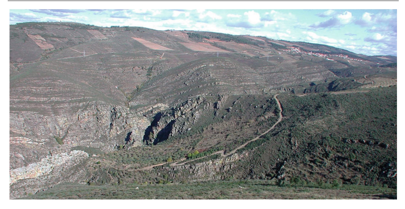
Fig. 11.2 Residual quartzite ridge in the south flank of the Poiares syncline, Freixo de Espada à Cinta