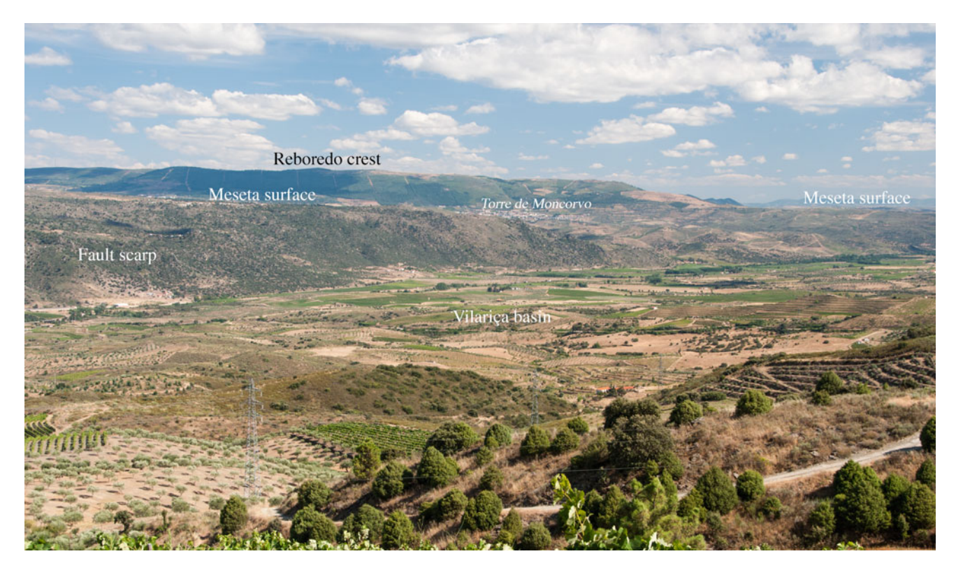
Fig. 11.5 Vilariça fault scarp limiting the Vilariça basin to the east and imposing a difference of 300–400 m between the flat valley and the Iberian Meseta surface