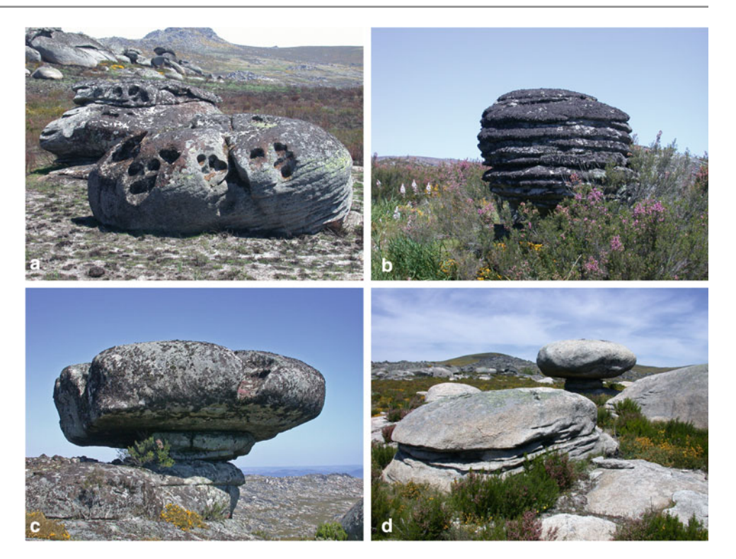
Fig. 11.3 Examples of minor granite landforms in the Serra de Montesinho: blocks with gnammas (a) and pseudobedding (b) nearby the Serra Serrada dam; pedestal blocks with gnammas, gutters (c) and pseudobedding (d) in the Cheira da Noiva sector

component during Plio-Quaternary time in the form of fault outcrop kinematic indicators, the presence of basins along the fault zone that may be interpreted as strike-slip tectonic basins, and compressive structures that may be interpreted as push-ups developed on restraining bends (Cabral 1989, 1995, 2012; Cabral et al. 2010). Further evidence that points towards this interpretation includes offset of river terraces, left-lateral stream deflections, beheaded streams, aligned saddle-like depressions, triangular facets and linear valleys (Cabral 1989, 1995; Rockwell et al. 2009).