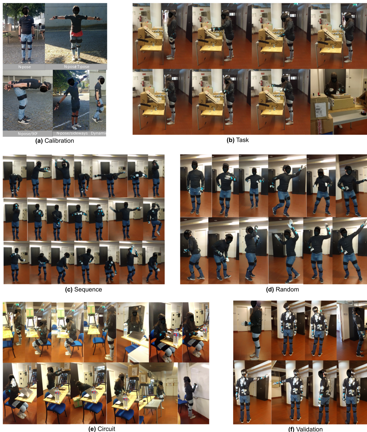
Fig. 2 Frames, from video records captured during data acquisition, illustrative of datasets' movements for each of the 6 types of movements: Calibration (a), Task (b), Sequence (c), Random (d), Circuit (e) and Validation (f).

All trials were initiated with the participants holding a static N-Pose for 5 seconds and then proceeding to execute the motions. This was always initiated on the same location and as far away as possible to sources of magnetic disturbance for each of the datasets.