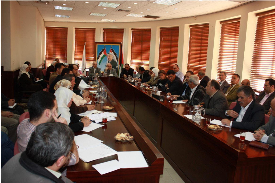
Fig. 3 A meeting with the participation of public (Municipality, 2012)

This partnership decided also to involve the public in the follow-up plans, the execution, and the monitoring of the performance. In order to achieve that, they set up a model of specialized committees. The main planning team was the responsible for integrating the result of discussions as defined strategies. However, each committee included represents for the majority of the civil institutions in Nablus that specialized in a certain development area (Municipality, 2012).