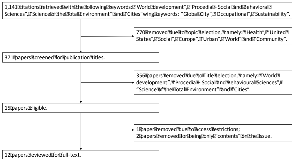
Figure 2 - PRISMA flowchart details.