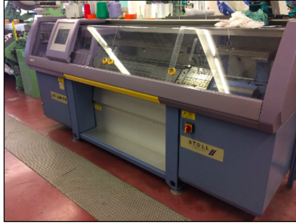
Fig. 1. Flatbed knitting machine STOLL CMS 320 TC

The pattern used was based on a purl structure, see Fig. 2, through zigzag arrangement of the face and reverse loops. The knit pattern was in planar form and after production it tend to curl and form a three-dimensional geometry.