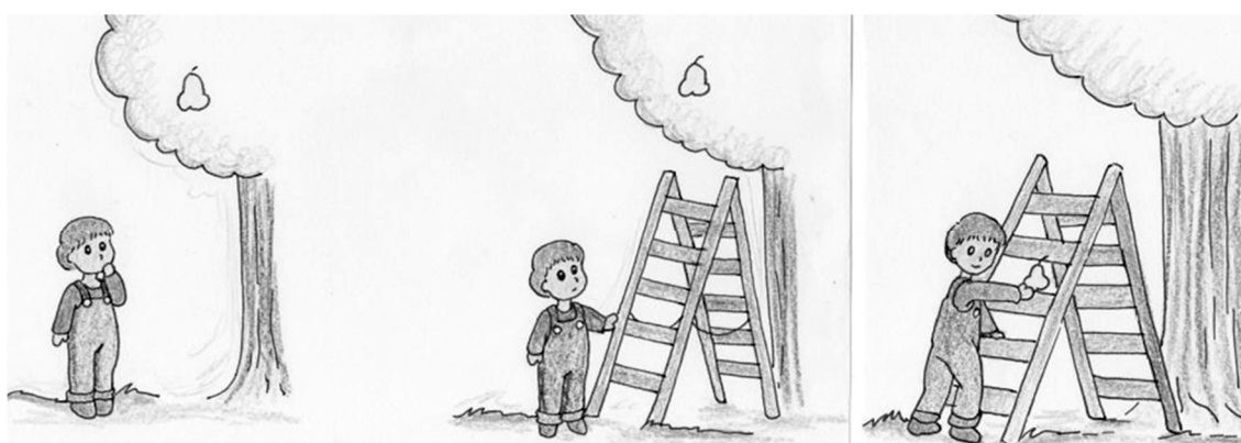
Figure 1. Picture sequence.

The procedure is as follows: Each picture sequence is introduced by a short narrative where a boy, called João/Peter, is involved in an act (e.g., picking a pear from a pear tree). A question about this narrative sequence follows which contains, or does not contain, the referent of the direct object. In their answer, the participants have to use the direct object (see Example 5). 2