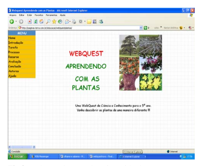
Fig 2. Webquest layout: "learning with plants".

The webquest was entitled "Learning with Plants" and it's an activity that tries to identify the types of leaves, flowers, fruits and stems using the Internet. This theme belongs to the Sciences subject in the 5<sup>th</sup> grade and is classified as long term. The goal is to work on these activities in four classes. The webquest layout can be seen in picture 2.