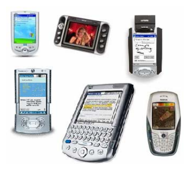
Fig. 1 Examples of Mobile Devices

The mobile devices technology appeared around the 90s. At first it was used as a resource to electronic notebooks and calculators, but with the development of powerful and smaller processors they were converted into small mobile computers. An example of these devices can be seen in picture 1.