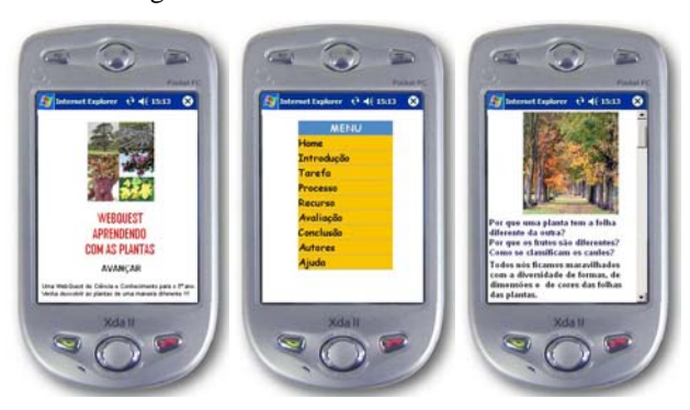
Fig. 3. Webquest layout in mobile devices.

The developed webquest when accessed through the mobile devices has a different layout from the one when the access is made through a browser, due to screen limitations and limitations in the devices. The information is the same; the only change is in the arrangement and size of the pictures. The image of this activity can be seen in fig 3.