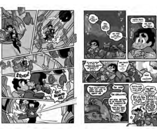
Fig. 2. Fight scene paneling and emotional scene paneling; "Steven Universe" issues six and two, published by Kaboom!Comics, 2014

This transcodification of the animated series into comics focuses on extending the cartoon to an older audience, mostly that of the fandom, and acts as a way to bring their collectively creative ideias into the series. As mentioned before, regarding the concept of participatory authorship Meyers analises, "Wherever possible, the MLP comics utilize fan-created concepts and characters, mixing these with the "official" canon of the show and then receiving Hasbro's stamp of approval on these fan ideas and characters. (...) In a way, these licensed products are