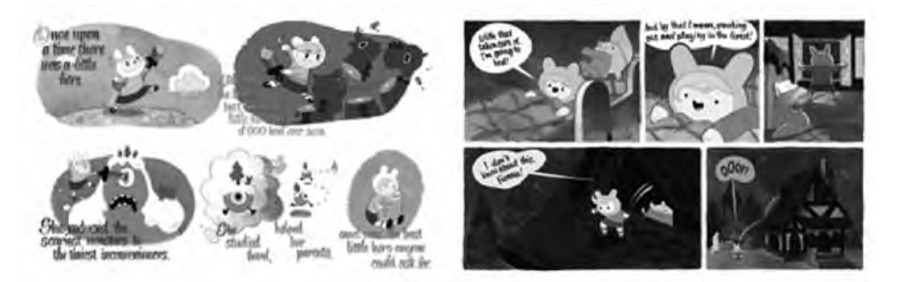
Fig. 3. Children's book comic on "Adventure time" comic issue 1 published by Kaboom!Comics, 2014

The "Adventure Time" comics diverge from the animated series, principally, because of the variety of artists that work on the comic version, that contribute with their vision for both the art style and narrative, whilst, the cartoon series features only some episodes created by invited artists that present, for instance, a 3D take on the show's characters and environments, as mentioned in "The art of OOO"[2].