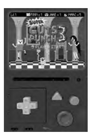
Fig. 1. "Adventure Time with Finn and Jake" comic chapter cover and "Adventure Time with Fionna and Cake" comic page published by Kaboom! Comics, 2012 and 2013

Being influenced by trendy themes and fans appetite for something new, a lot of today's most successful cartoon series use iconography that wasn't common in earlier works. Today's audience is much more familiar with Japanese animation and manga, video games and tv series stereotypes, which are some of the most used references for comedic value and visual representation in today's cartoon series. As seen in Tumblr, the social network that is home for many fandoms, the fans tend to discuss the references used for these shows and special episodes, even reviewing them on Youtube. For instance, "channelfrederator" at Youtube, in the video "MORE Steven Universe References You Missed!!"[9] revises some animation sequences and designs that are direct references to the famous cult anime.