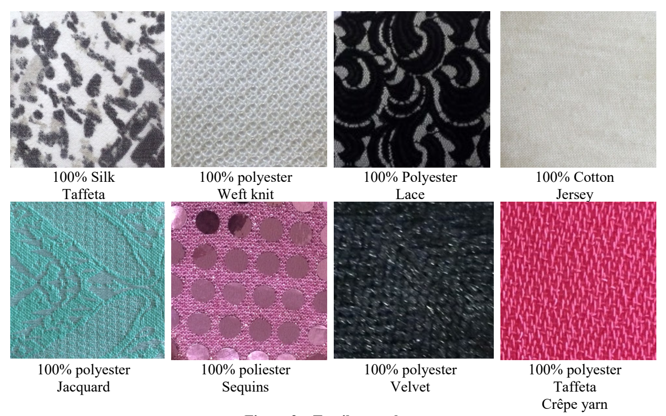
Figure 2 – Textile samples.

The panels of naive assessors were invited to touch and describe the sensations arising from the touch in 8 samples with different textile structures and fiber compositions, which were cut into 20X20 centimeters pieces (Figure 2). The samples were from a set of 54 samples used by researchers from the southern region of Brazil [24].