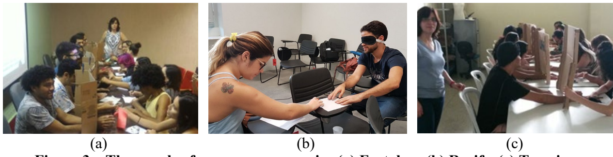
Figure 3 – The panels of sensory assessors in: (a) Fortaleza (b) Recife, (c) Teresina.